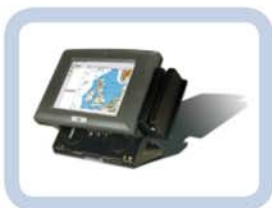
5.7" AFOLUX PPCs