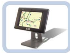
Wide AFOLUX PPCs