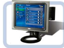
15"~19" AFOLUX PPCs