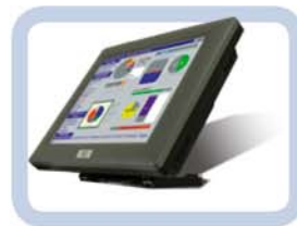
10.2~12.1" AFOLUX PPCs